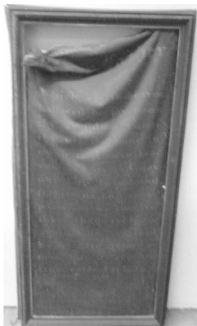
Front before treatment