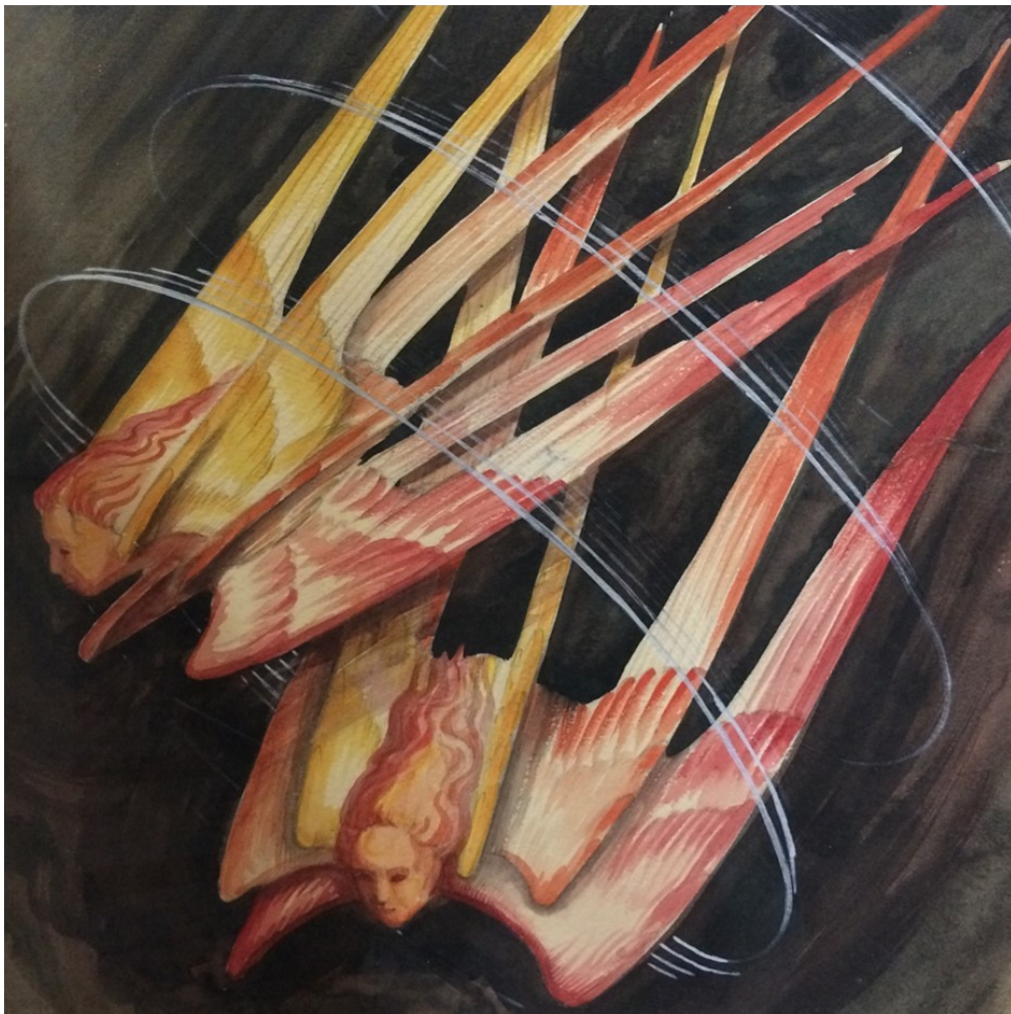
Design for Stained Glass Window Francis Spear