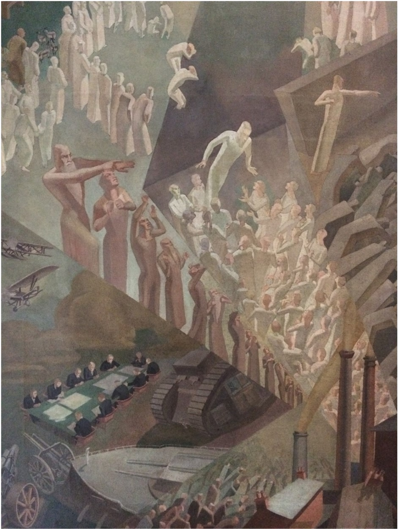
Allegory of War, the Last Judgement