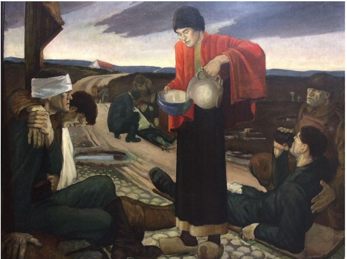
The Good Samaritan