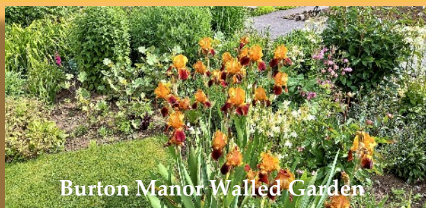
Burton Manor Walled Garden