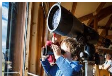
Binoculars & Telescopes Open Day 22 & 23 July