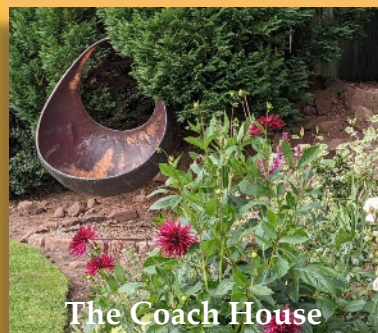
The Coach House